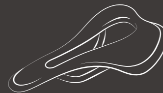
Injection Molding Bicycle Saddle